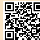
Design: Ulrike Kersting